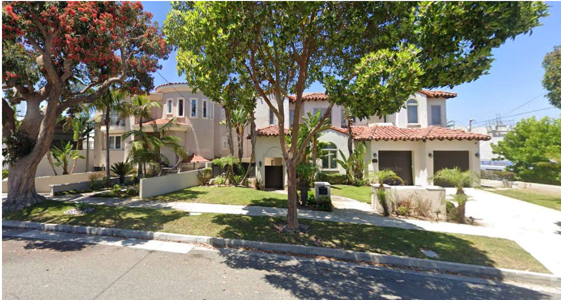
Torrance Blvd. between S. Irena Ave and S. Juanita Ave