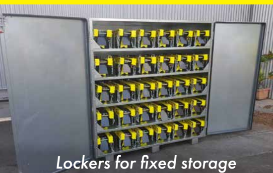
Lockers for fixed storage

AST trailers are made in the United States and comply with US DOT regulations. Each trailer is specially designed to safely store and transport the MVB3X system inventory. Built with ease of use in mind, every complete system includes the specific number of MVB3X barriers, appropriate size trailer and the accessories to meet your operational requirements.