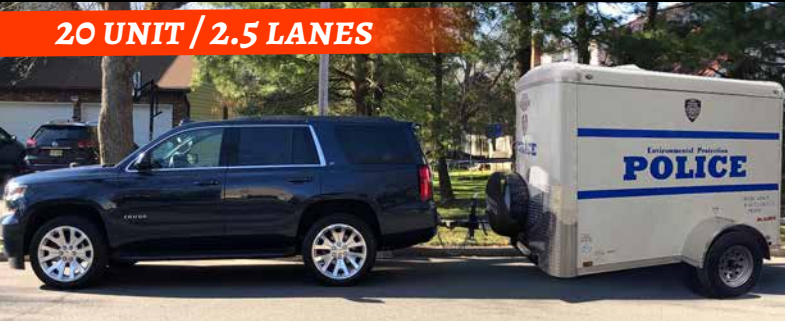
20 UNIT / 2.5 LANES