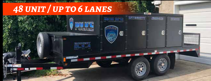
48 UNIT / UP TO 6 LANES