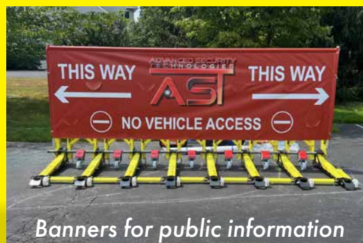
Banners for public information