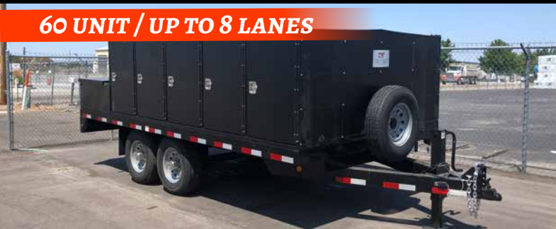
60 UNIT / UP TO 8 LANES