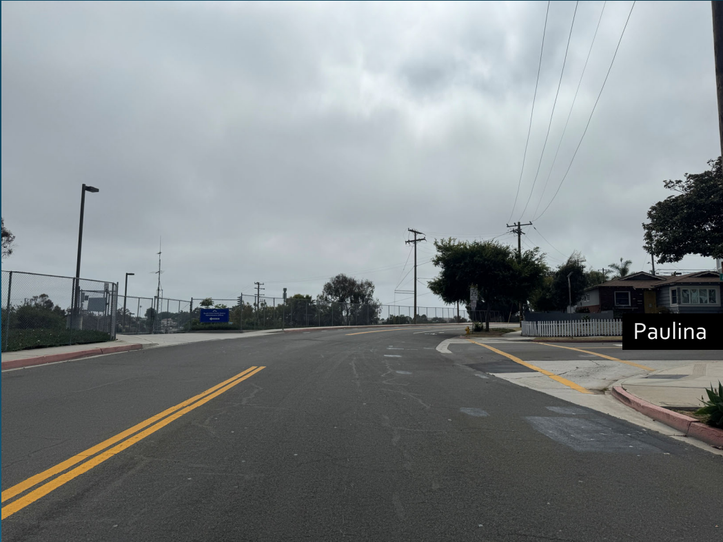
Westbound Del Amo from roadway