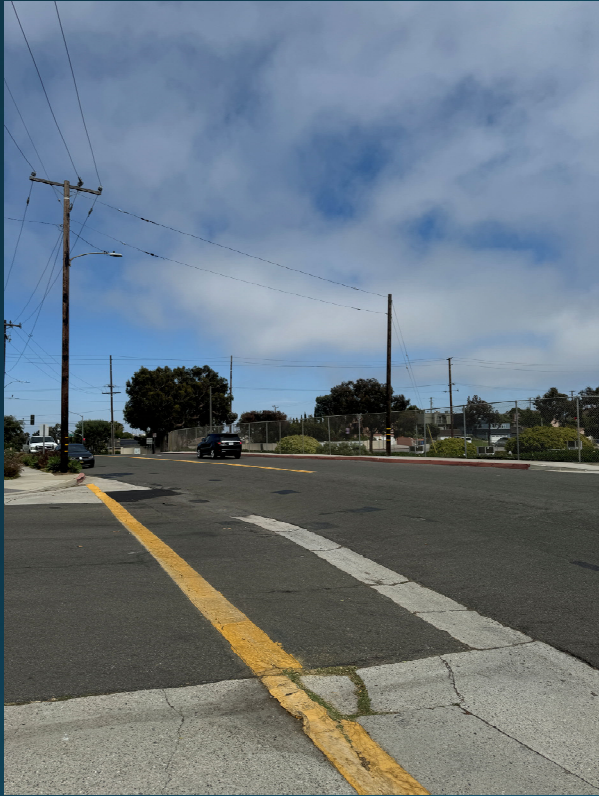
North side sidewalk, looking east