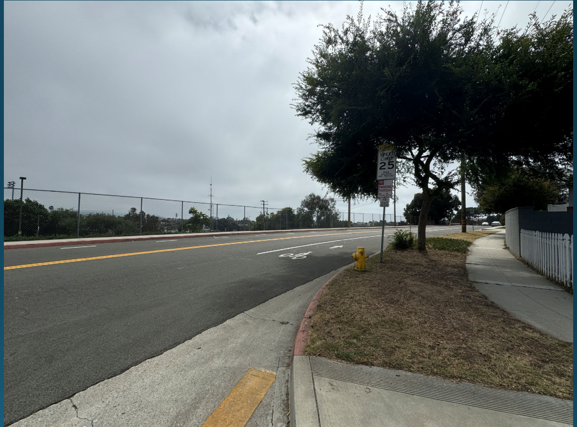
North side sidewalk, looking west