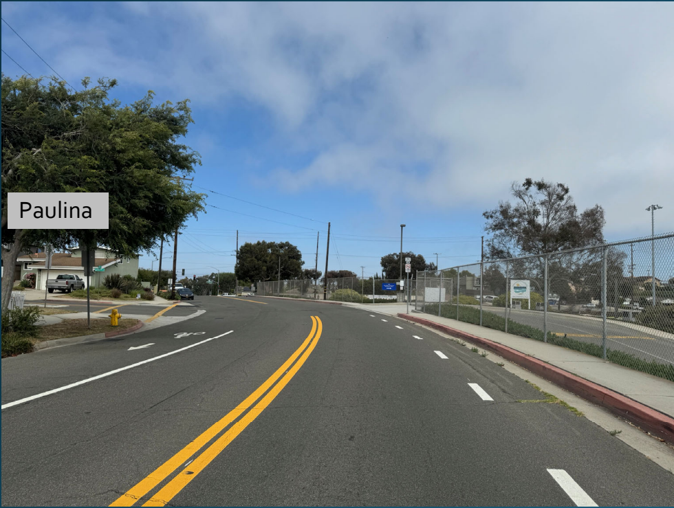
Eastbound Del Amo from roadway