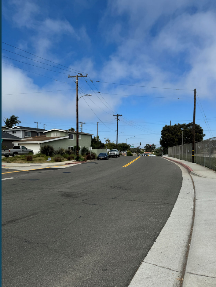
South side sidewalk, looking east