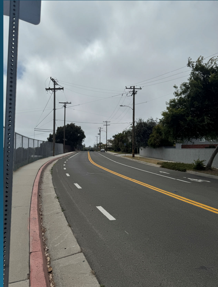
South side sidewalk, looking west