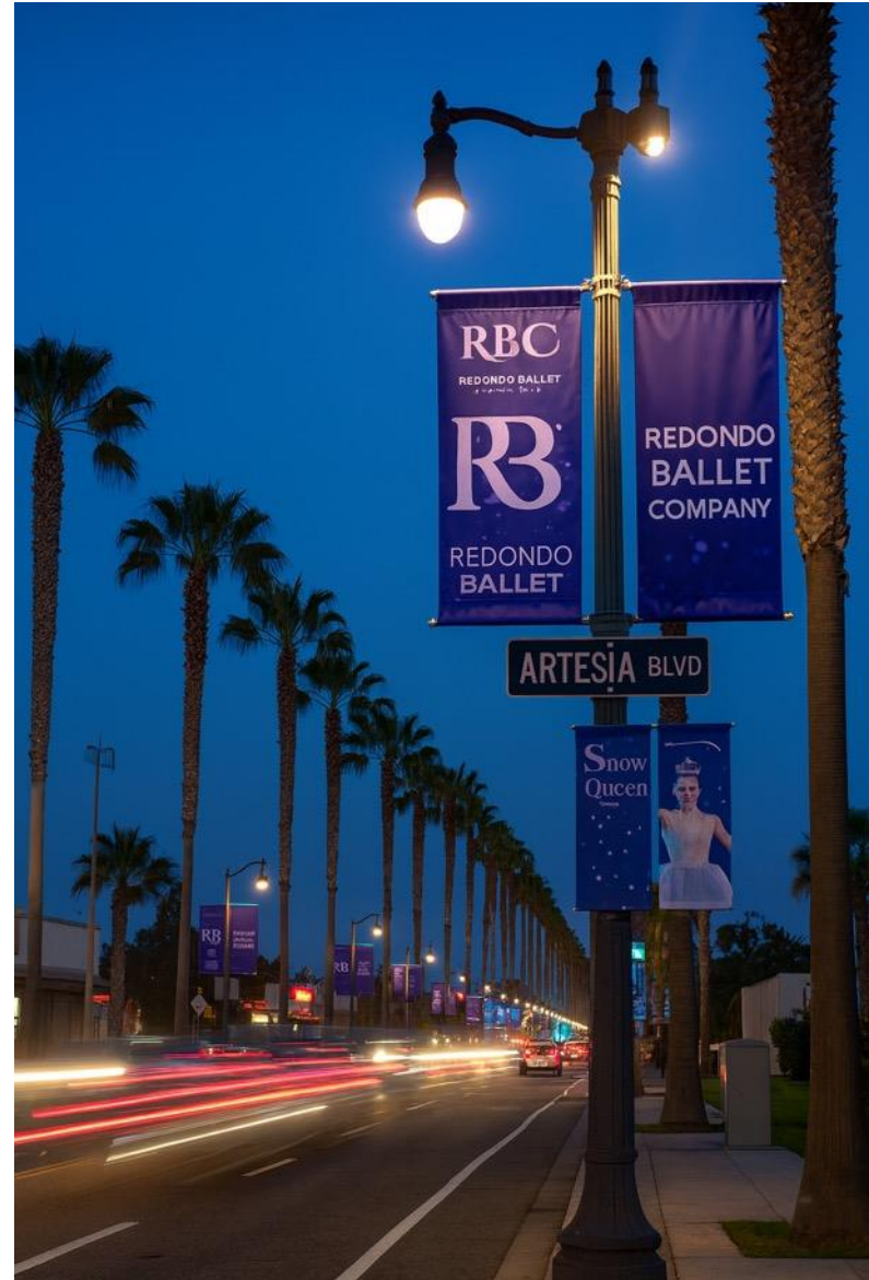
AI-generated images to envision what could be possible