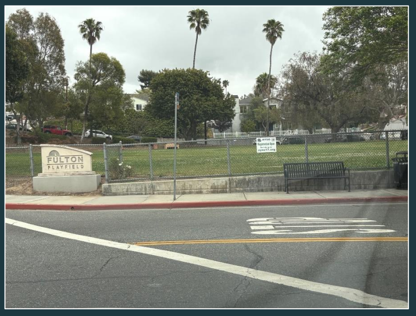
Rindge Lane & Ripley