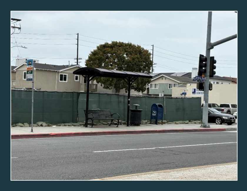
Artesia & Mackay Lane