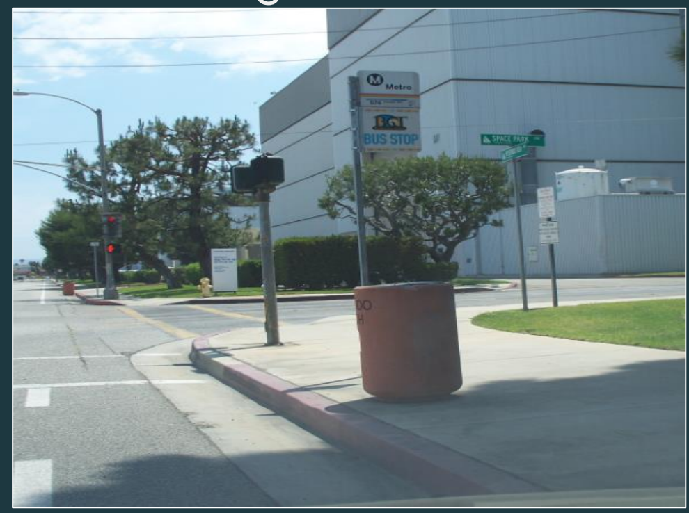
Redondo Beach Ave & Space Park Dr.