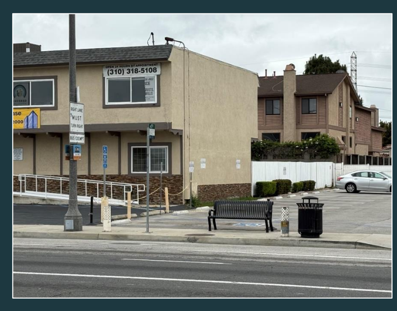
Artesia & Inglewood