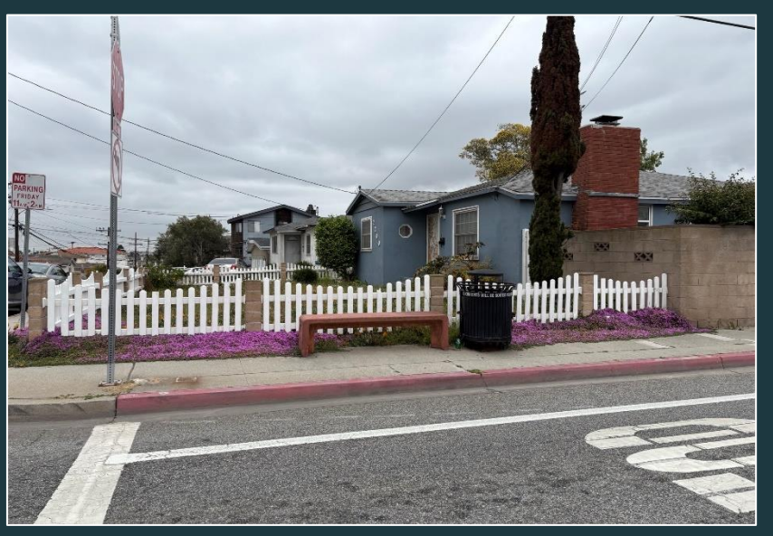
Rindge Lane & Clark