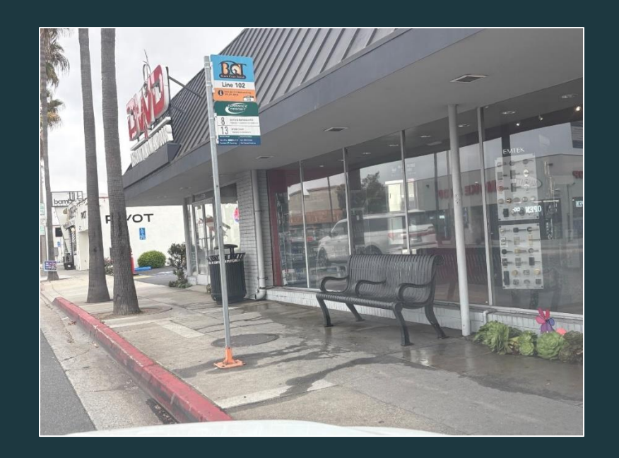
Artesia & Rindge