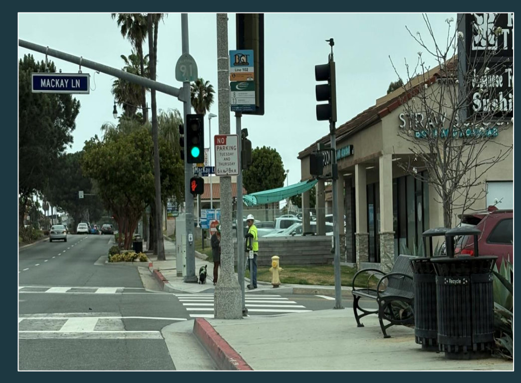
Artesia & Mackay Lane