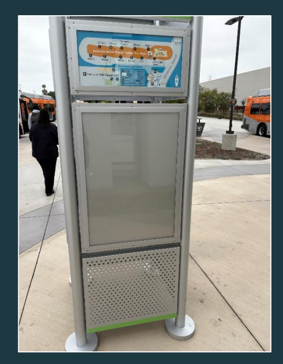
Redondo Beach Transit Center Kiosk