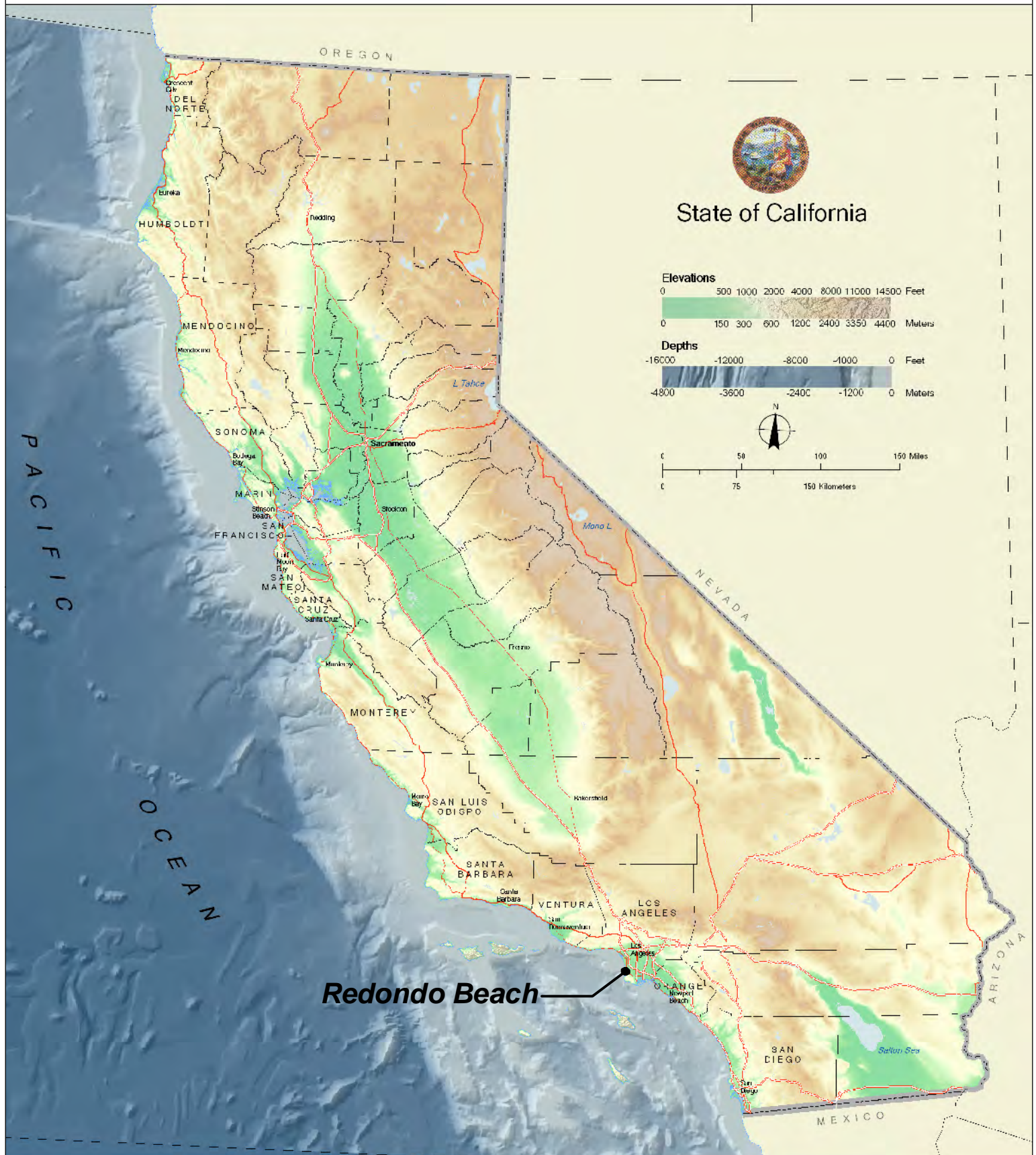
EXHIBIT 1: REDONDO BEACH LOCATION MAP