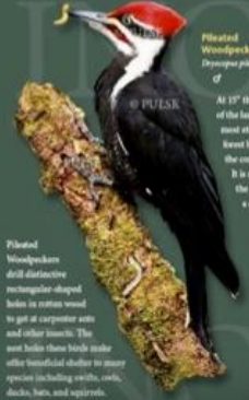
Pileated Woodpecker Dryocopus pileatus ♂

Have you wondered what that woodpecker is doing banging his beak up against a tree? As a tree ages, insects make their homes inside the tree's trunk and under its bark. Woodpeckers look for these hidden insects which are a great source of food. Woodpeckers in Pilcher Park include the Red-bellied, Red-headed, Hairy, Downy, Pileated and the Northern Flicker. Look for woodpeckers year round.