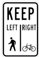
R9-7 Peds left/ bikes right