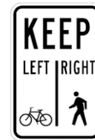
R9-7 Bikes left/ peds right