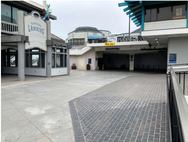
A section of the south pier area where pedestrian and bicycle traffic overlap

Other recommendations related to signage were made by staff in the 2016 report to help address some of the issues surrounding the signage and enforcement of this part of the pier, including additional paint modifications, bike path markings and general pedestrian warning signs. The signage recommendations were later implemented and have been in place since that time.