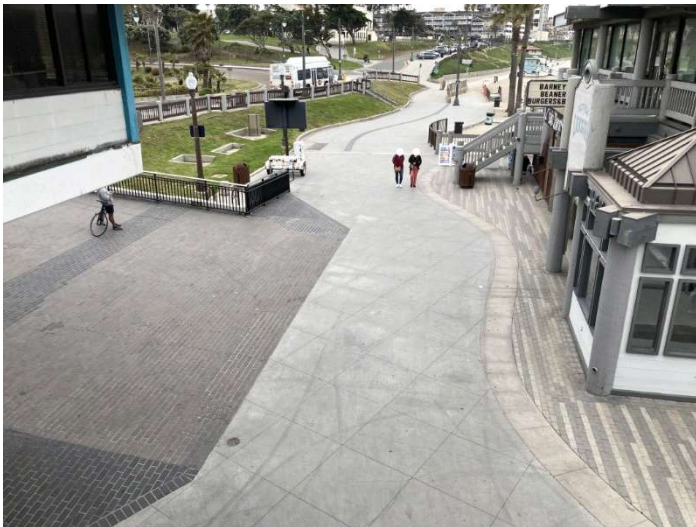
A view of the south pier area identified by Harbor Commission

Please note that, typically, a traffic and circulation discussion is also presented to the Public Works and Sustainability (PWS) Commission for feedback and recommendations to the City Council. The next PWS Commission meeting is on Monday April 24, 2023. However, City Council directed staff to return to City Council in April and, given the timing, staff was unable to present the matter to the PWS Commission.