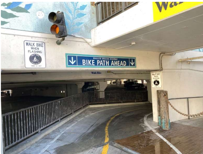
An example of signage along the bike path instructing cyclists to walk bikes

Additionally, the wet surfaces that often appear on the pier during inclement weather can create an additional hazard for bicycles traveling at 5 mph, with risk for slippage increasing if an E&T study concludes that a higher speed limit is supported. Enforcing the walk-bike rule consistently helps to minimize the risk of accidents and injuries at all hours of the day. For these reasons, staff recommends keeping the prohibition in place within the parking structure, and instead placing chicanes strategically at certain locations throughout the pier area. This would encourage bicyclists to follow the walk-only regulation. Please see Exhibit A which is attached for an example of how the chicanes could work. The City's pier is unique in that it attracts recreational users, retail/restaurant customers, as well as employees. As a result, people can be present at the pier from the early morning, as commercial fishing employees arrive to work to late at night when customers dine at nearby restaurants. Thus, staff concludes that the blanket prohibition is warranted at all times.