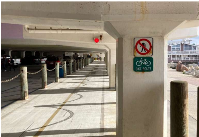
An example of signage indicating a bike route within an area where bicycle riding is prohibited.

One area within the parking structure that can be safely reopened to bicyclists is the roughly 330 foot linear stretch between the southern parking structure restrooms and the first turn to the north (see the picture below). This area is clearly delineated for bikes, pedestrians and vehicles and can be safely traversed. It is recommended that signage be adjusted to allow for bicycle riding along this path.